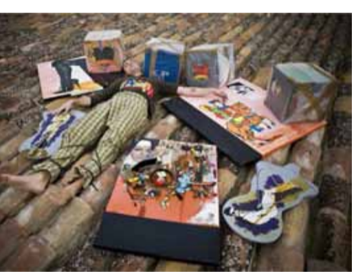
JARR, La muerte del arte, performance, 2008