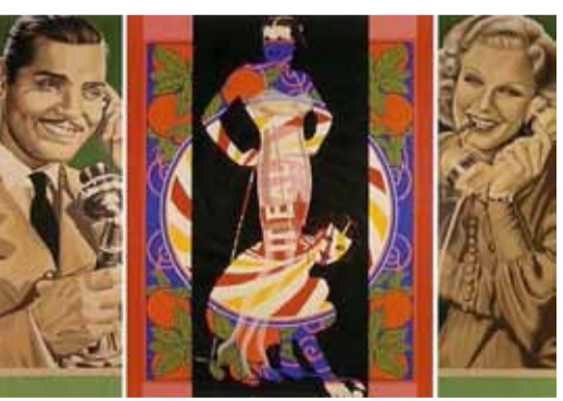
Cuqui Guillén, 'Black Pearls', Triptych, 2007