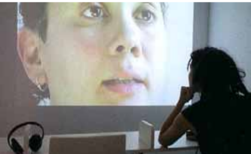
Mau Monleón, "Human contra-geography", Installation, 2008