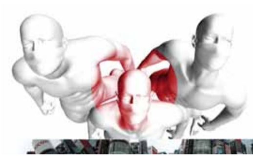
Jesús Azogue, Serie Japón, Fotografía digital, 2009