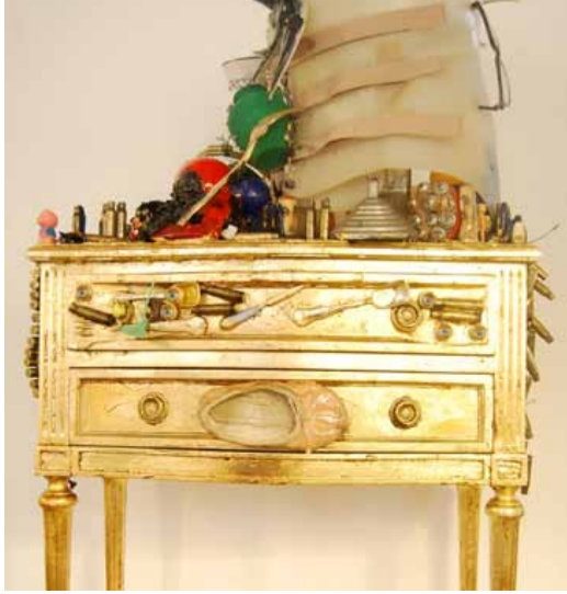
JARR, Autorretrato, reciclaje y pan de oro, 2008