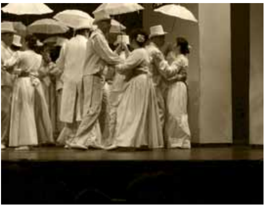
ISEACV, 'Luisa Fernanda'